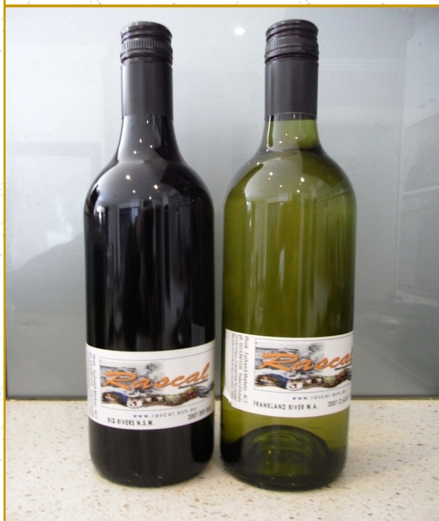
Rascal wine label. Introduced in 2009.