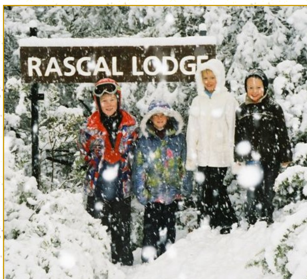
2004 was a good snow year

Extract from 2003 Newsletter describing impact of 18 Jan 2003 firestorm on Rascal.