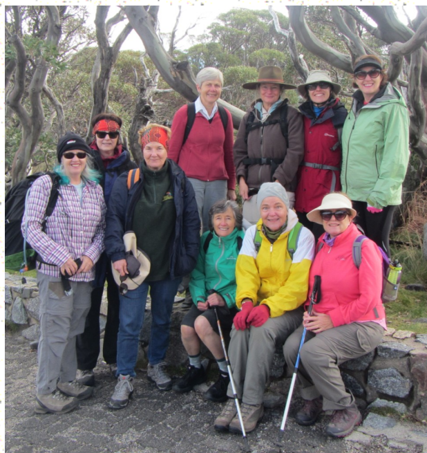
2016 Hike de Femmes about to embark on a walk from Charlotte Pass to Blue Lake and onwards to Mt Lee.

Japan attracts many a Rascal member during the Australian summer.