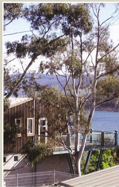
A lodge for mountain enthusiasts