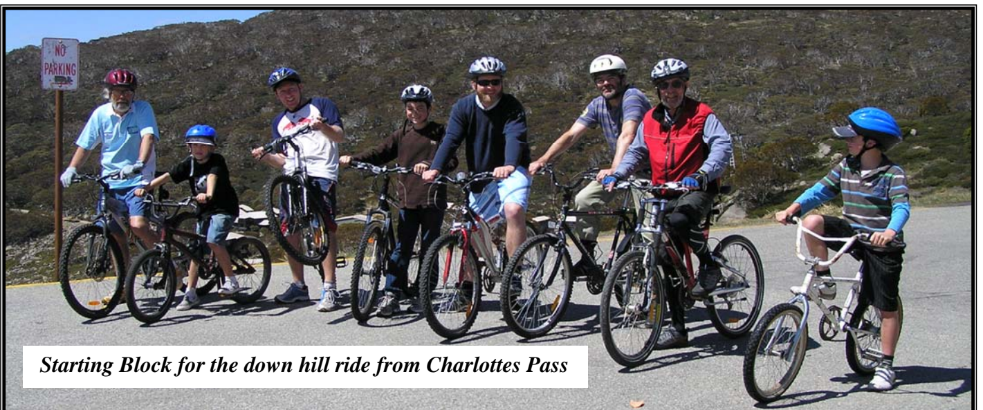
Starting Block for the down hill ride from Charlottes Pass