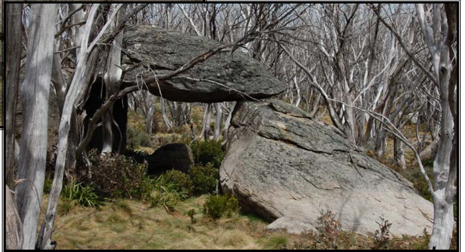
Below: The 'Devils Kitchen' rock formation

An early night again! Everybody pooped and full of good food. Sunday was to be a different day after a breakfast of bacon and eggs on the deck. Perk coffee to follow. A number of us had brought bikes. With bike racks and a car trailer we headed up to Charlotte Pass for a down hill ride. The kids were very excited and so were their mums! What will happen if little Johnny falls off? Well he didn't and all the kids had a ball. After reloading the bikes at Spencers creek we headed up to Rainers gap for the ride down to the old NPWS entrance. This was some ride! We were coasting at 64km per hour. After the kids and adults got over the adrenalin rush we headed back to Rascal for a late lunch on the deck. A leisurely drive home with good memories.